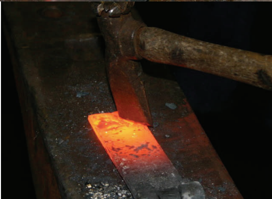
Step 7. Using a hot cut take off one corner of the hinge body as shown. This makes tapering the hinge body much easier