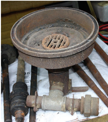
Ray's donated brake drum forge