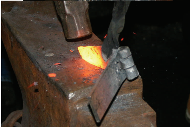
Step 8. Taper the hinge body to a blunt point