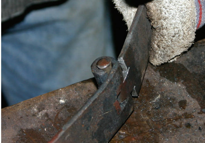
Step 6. Rivet the two halves together