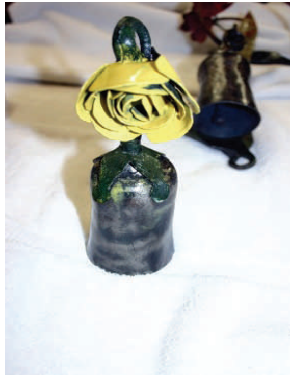
Keith's hanging bell and yellow rose of Texas table bell