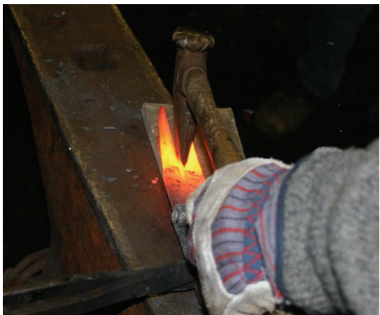
Step 9. Split the hinge body with a hot cut