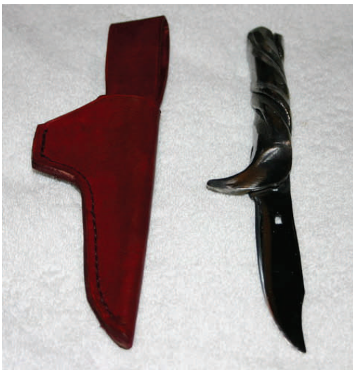
Dennis's horseshoe knife and sheath