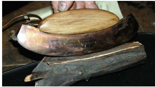
Charlie's herb knife from bearing race